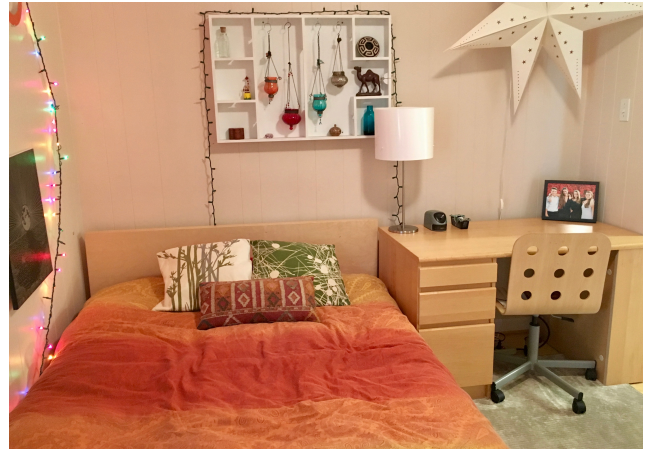
Private 2 Bedroom Apartment (Sleeps 1-4) https://www.airbnb.com/rooms/24499519