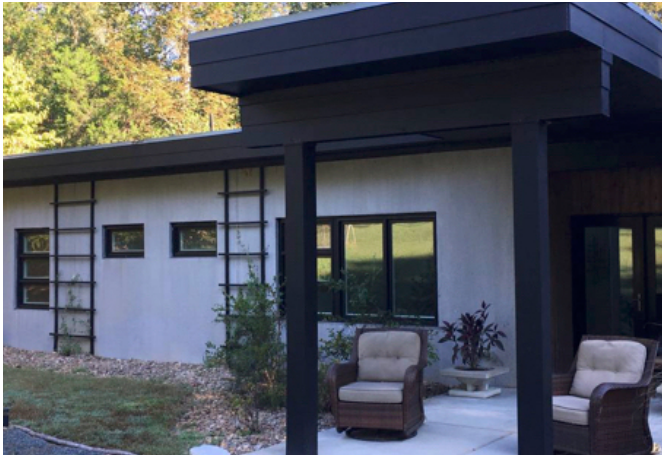
Private Master Suite (Sleeps 1-3) https://www.airbnb.com/rooms/28273975