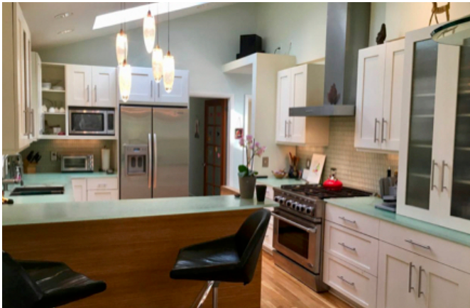
Private Upstairs Apartment (Sleeps 4-8) https://www.airbnb.com/rooms/27729694